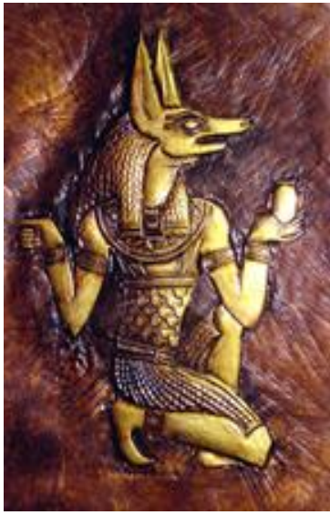
Anubis - the Egyptian god who oversaw embalming and mummification, as well as escorting the deceased through the procedures for entering the underworld.